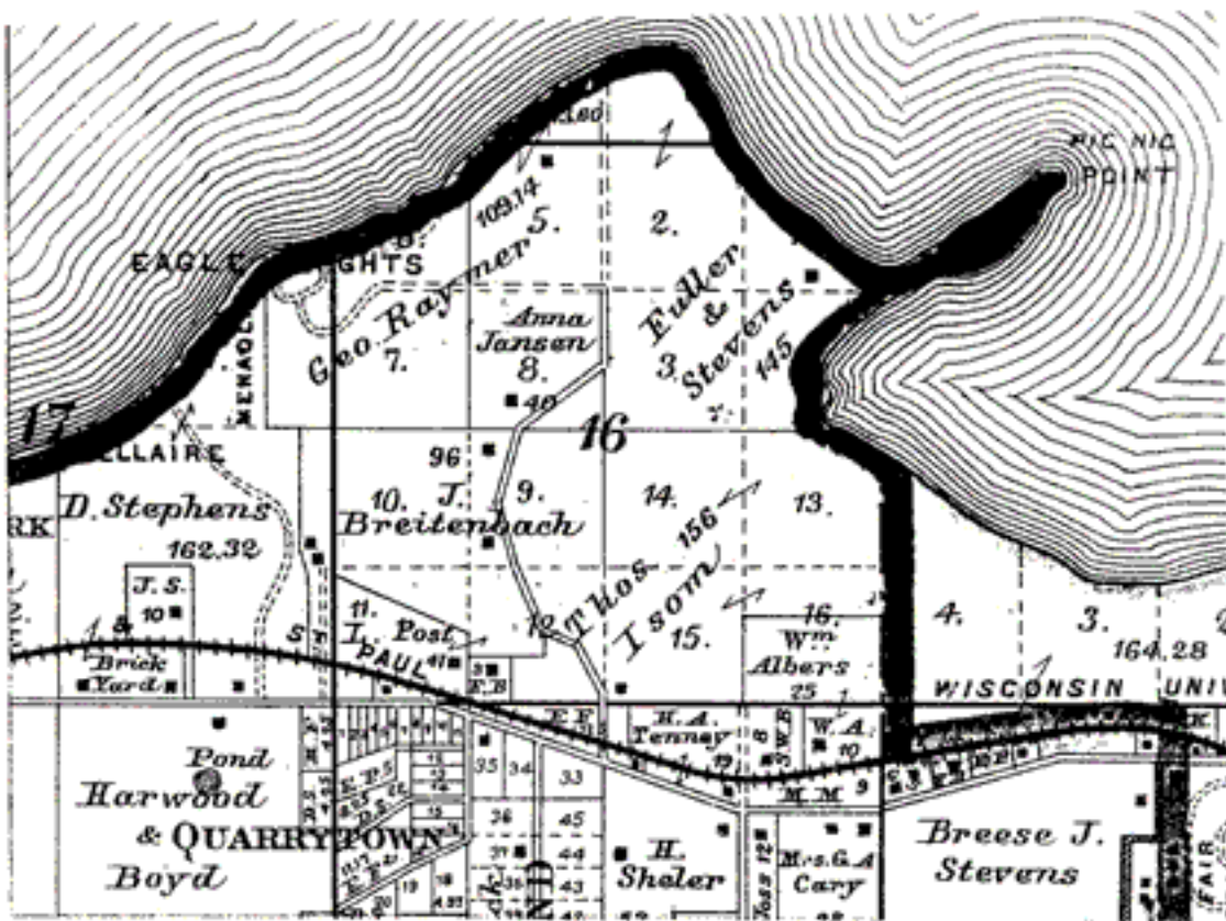
Portion of the 1890 plat map for the Town of Madison, showing the location of the George Raymer property. University Avenue (then called Sauk Road) is in the lower part of the picture, south of the railroad tracks. University Bay Drive passes north through the Ison and Breitenbach properties.